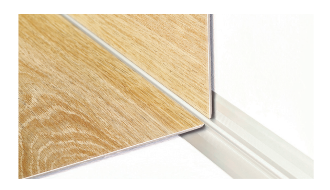
For specific installation instructions on Xtrafloor° see https://www.installandclean.com/en/lvtdryback

How to fill small joints to perfectly finish your floor and to help protect it from dirt & moisture